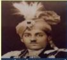
H.H. Sir Sadiq M. Khan Abbasi